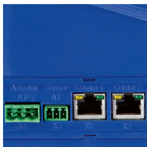
PLUG SOCKETS ON THE OUTSIDE